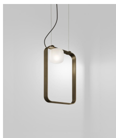
GROOV SP 60