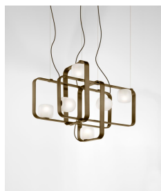
GROOV SP 4